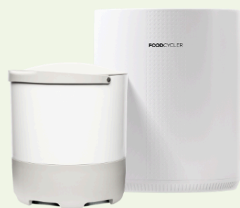
FOODCYCLER ECO 3