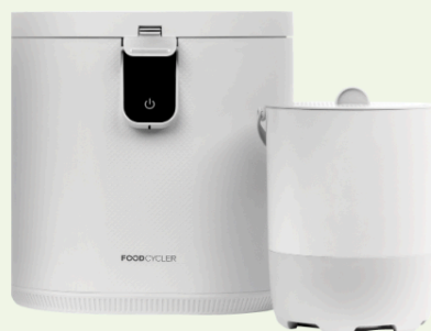
FOODCYCLER ECO 5